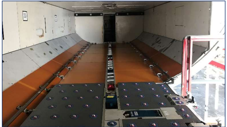
ANCRA A321 LOWER DECK CARGO LOADING SYSTEM; AFT BAY